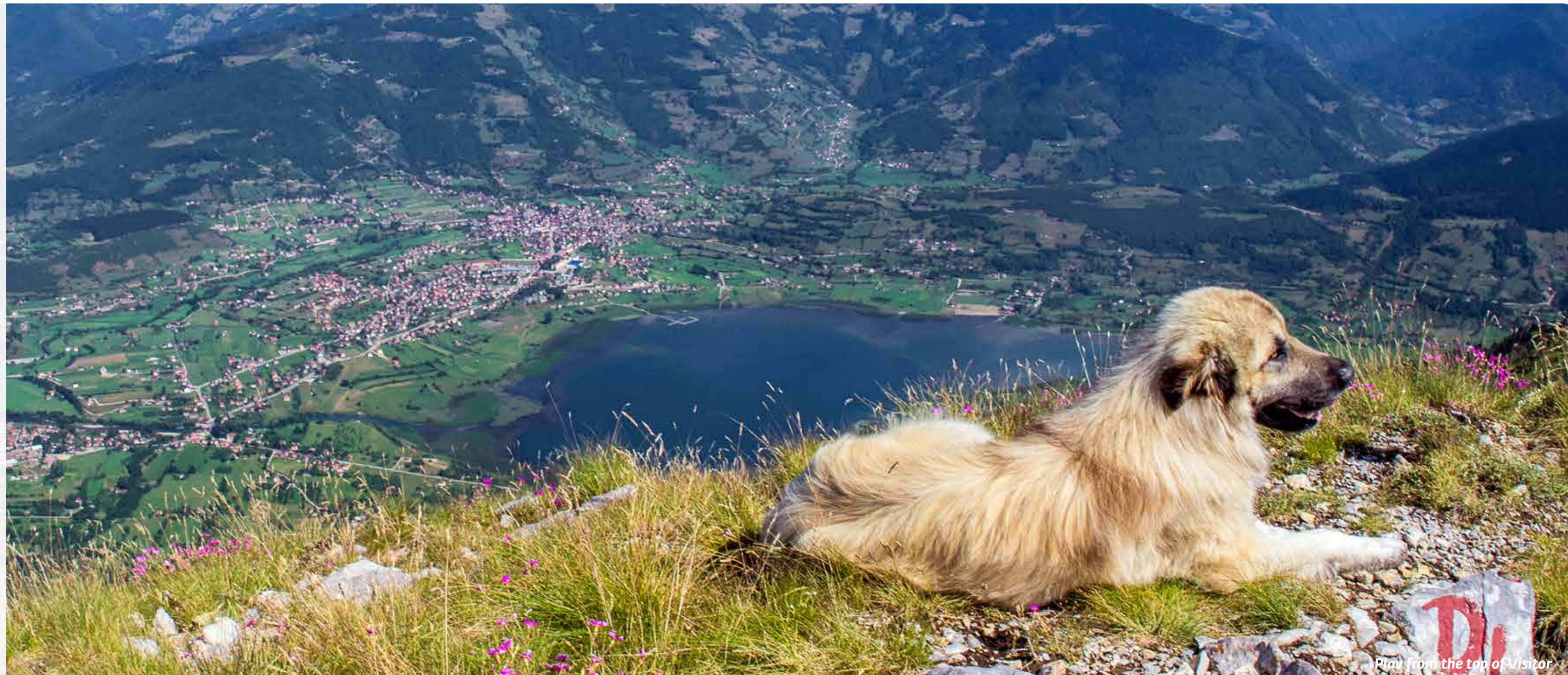
Plav from the top of Visitor

There are various legends about the origin of the lake.