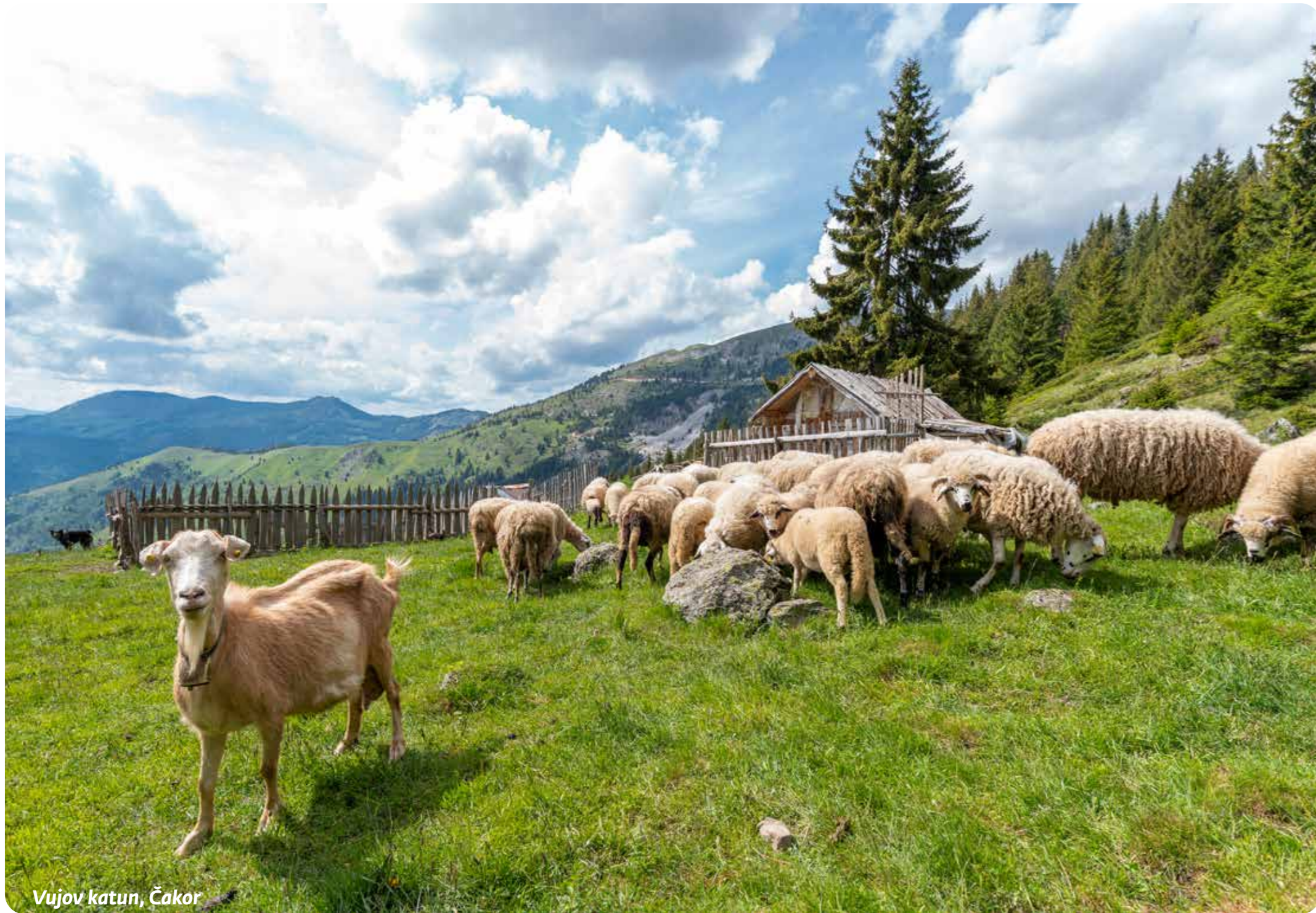
Vujov katun, Čakov