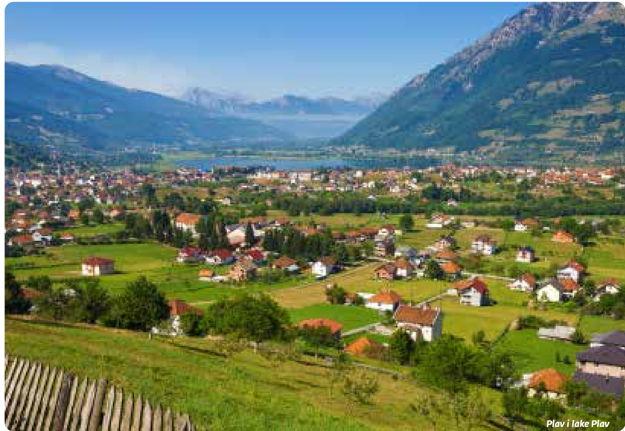
Plav i lake Plav