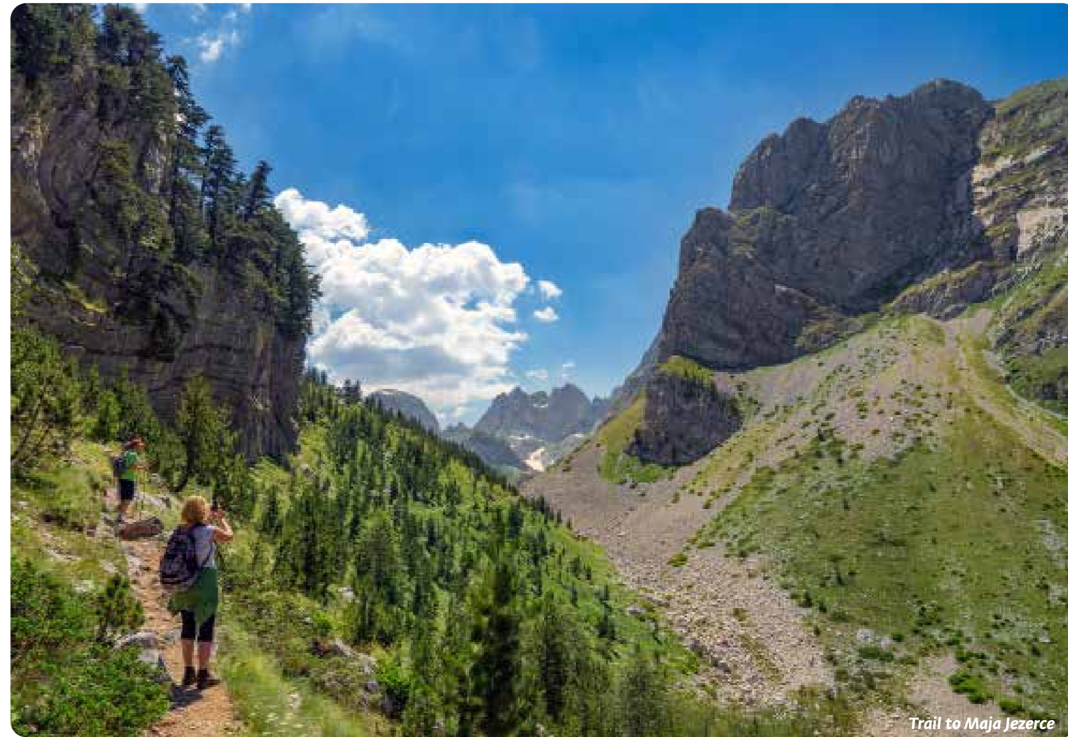
Trail to Maja Jezerce