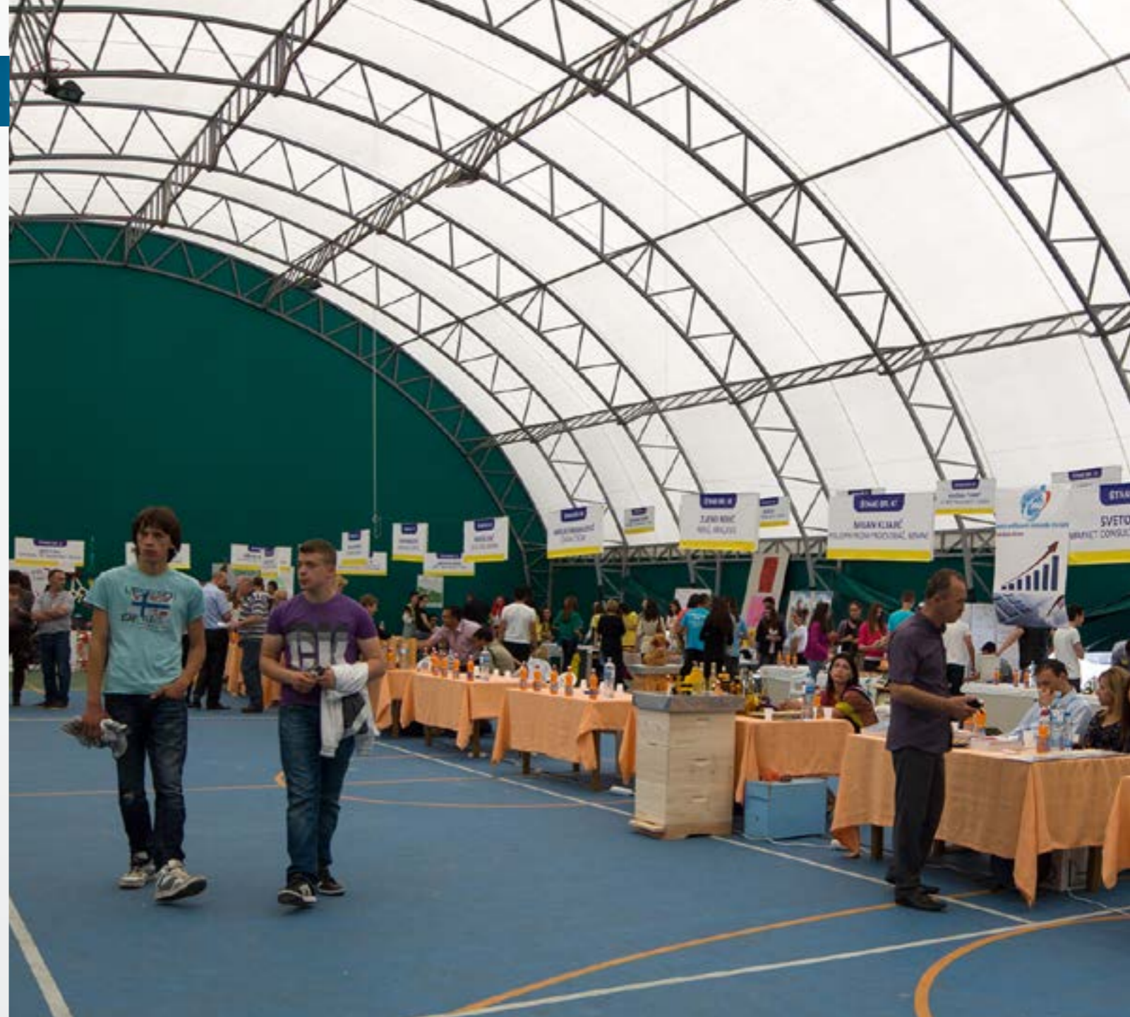
SAJAM ODRŽAN 10. MAJA 2013. U BERANAMA

The main goal of the Program is to encourage development of entrepreneurial climate which would motivate young people to build their own future. Specific objectives of the Program are: development of entrepreneurial skills of youth, their self-esteem and initiative, promotion of team work, provision of methods for planning of the future, innovation of learning process, networking.